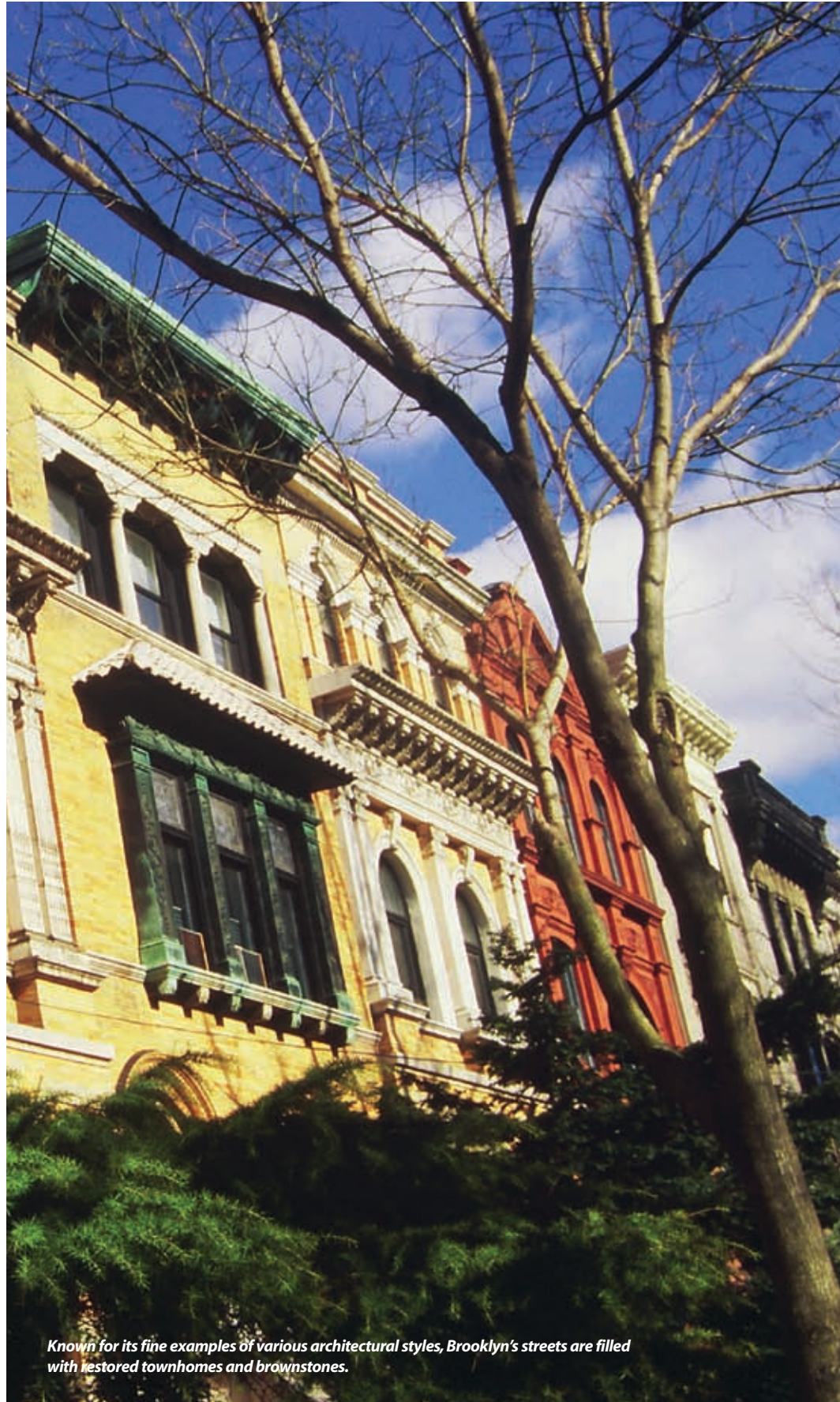
Known for its fine examples of various architectural styles, Brooklyn's streets are filled with restored townhomes and brownstones.

Park Slope Sports Club , 330 Flatbush Avenue