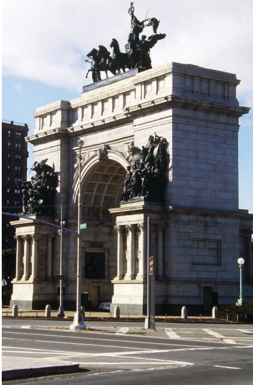
The Memorial Arch at Grand Army Plaza

became larger, more experimentation occurred in revival styles, including Italianate, Second Empire, Victorian Gothic, Romanesque, neo-Grec, and Classical. The area enjoyed a period of unmatched elegance throughout the nineteenth century. With the opening of the Interborough Rapid Transit system (IRT) in 1908, Brooklyn Heights was no longer secluded, making it far easier to live there and work elsewhere in the city. Many mansions became divided into apartments and boarding houses, and artists flocked to the neighborhood. But by the Depression era, the middle class had disappeared, and boarding houses had deteriorated into slums.