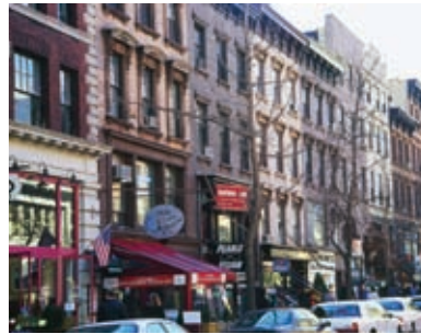
The proud borough of Brooklyn, NY lies just across the East River from Manhattan and maintains its own unmistakable identity, famous for everything from pizza to egg creams to “Dem Bums” of the 40s and 50s, the Dodgers.

The most heavily populated borough of New York City, Brooklyn consists of 81 square miles on the southwestern tip of Long Island. Officially designated a borough of New