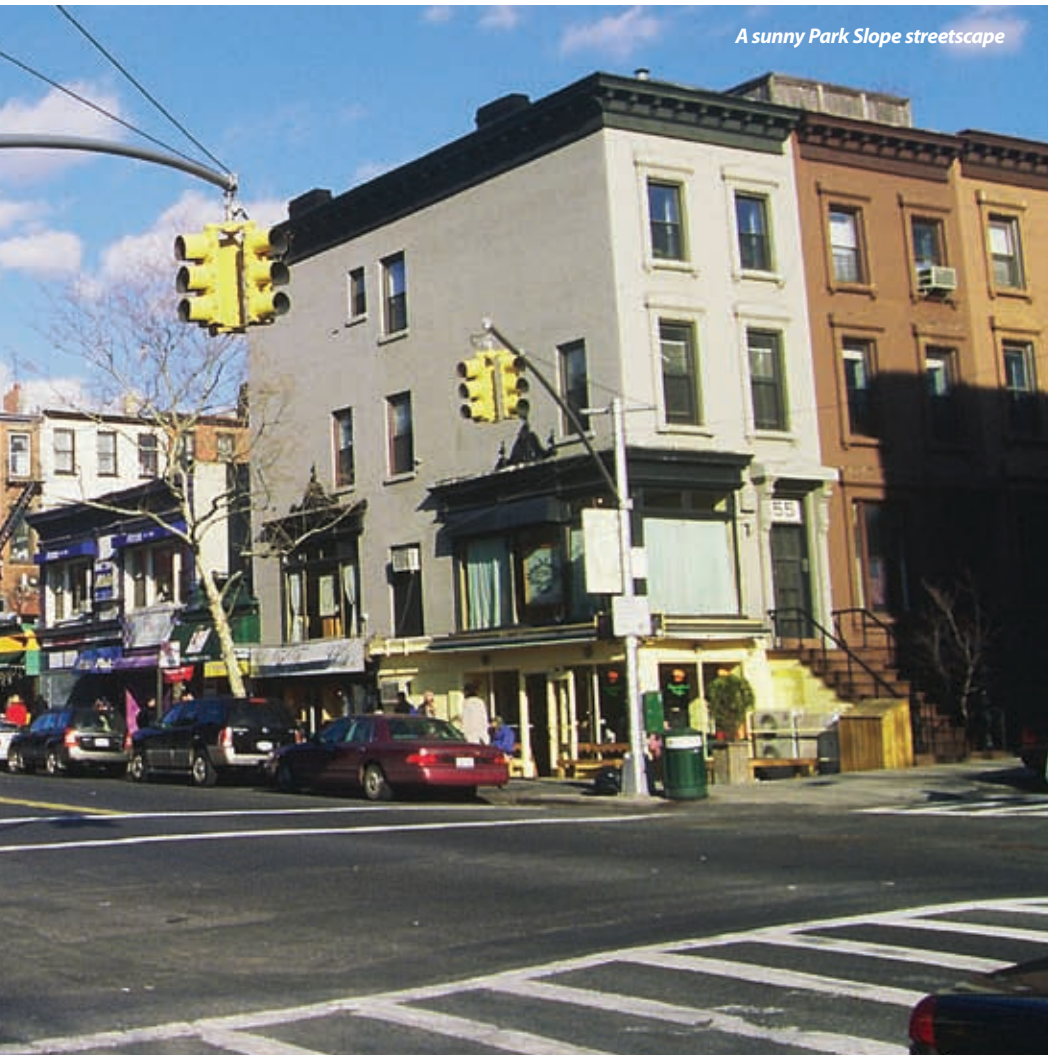
A sunny Park Slope streetscape

cutting-edge contemporary pieces, and other blockbuster exhibitions.