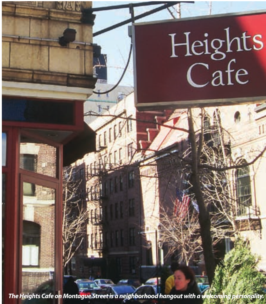
The Heights Cafe on Montague Street is a neighborhood hangout with a welcoming personality.

rows of brownstones were demolished to make room for institutional dorms and apartment buildings. In reaction, local residents formed the Brooklyn Heights Association to plan an Esplanade of park space along the East River. In 1965, a local group of residents called the Community Conservation and Improvement Council succeeded in having the neighborhood listed on the National Register of Historic Places and as the first Historic District in New York City. Later gentrification in the 1970s and 80s led to the transformation of boarding houses into middle-class residences and condominiums.